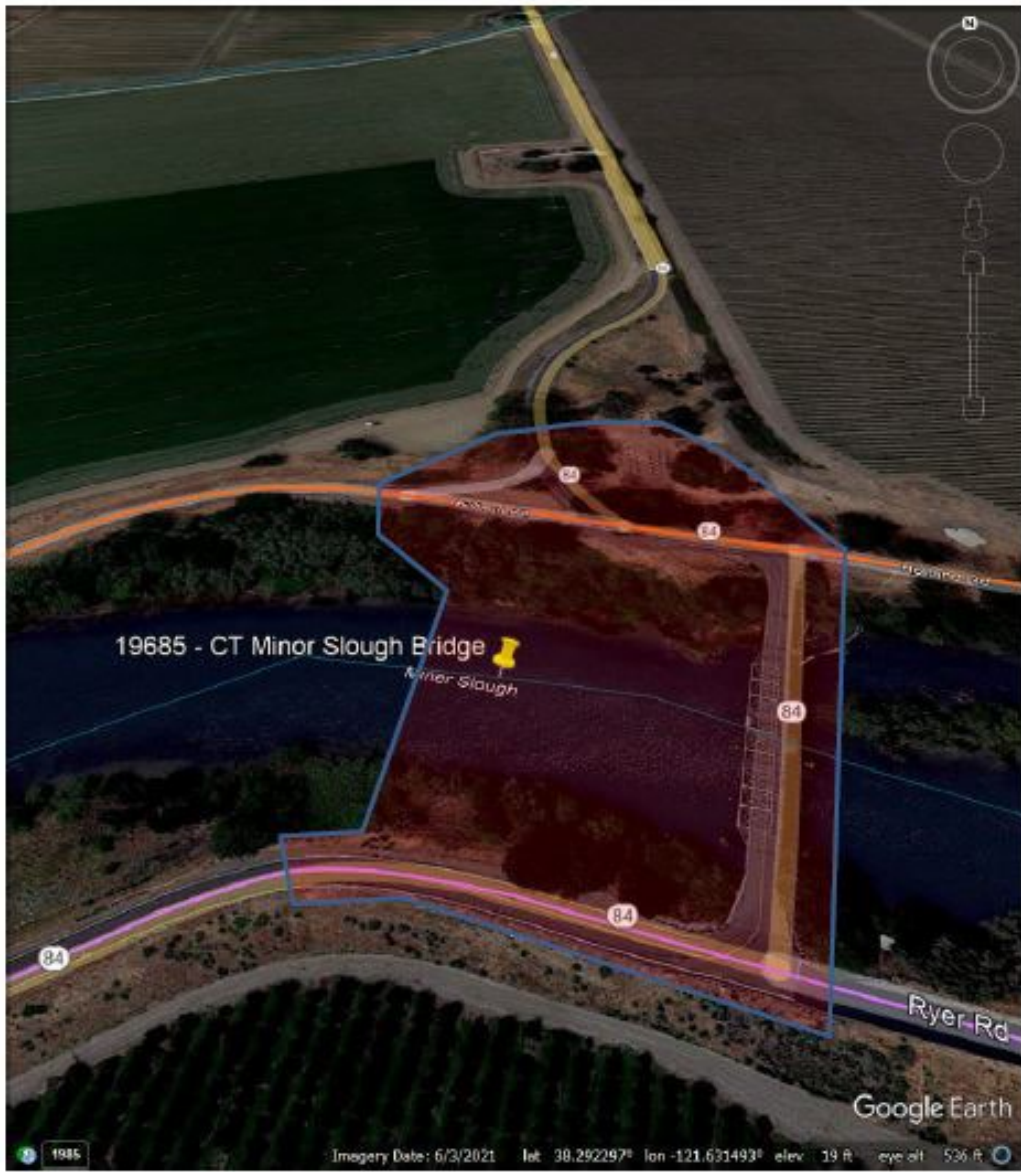
3) Approximate project footprint map